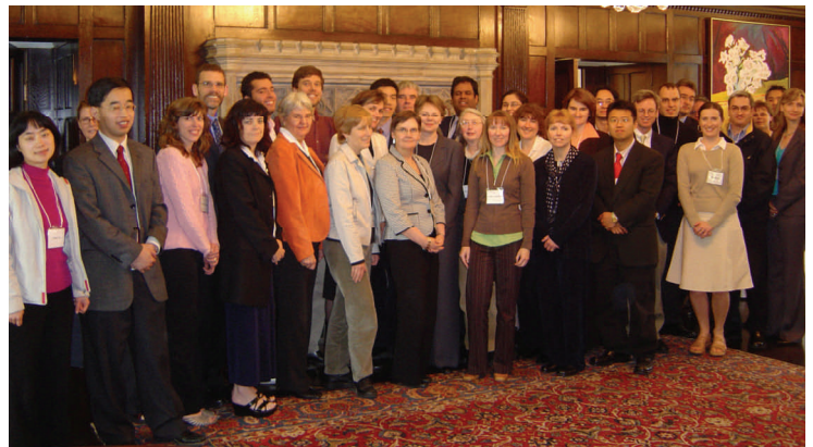
CCORT members gather at the national team meeting in Toronto to celebrate its fifth anniversary and to share ideas about potential research topics for CCORT II

Key findings from the Canadian Cardiovascular Atlas series were highlighted, including: